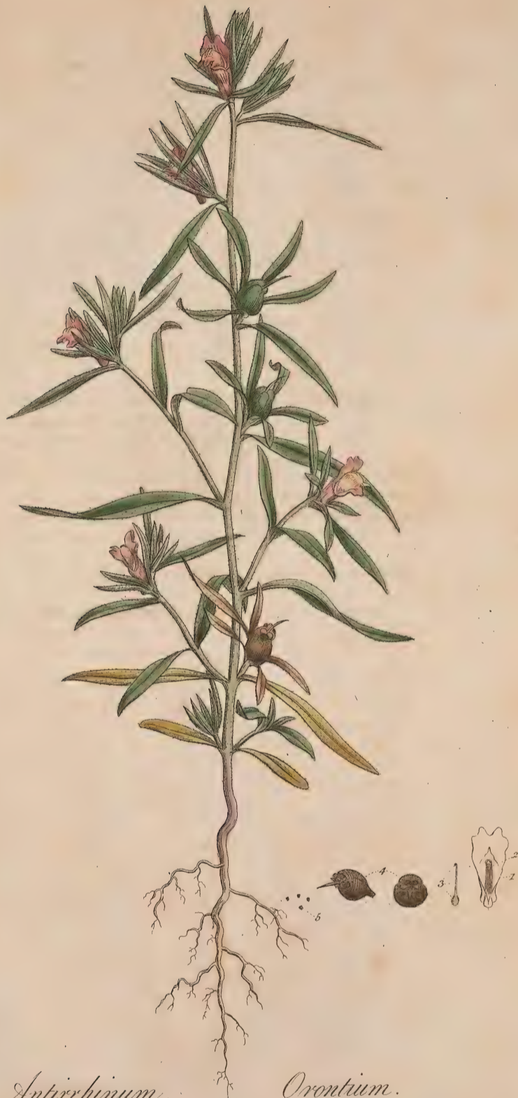
Antirrhinum Orontium .