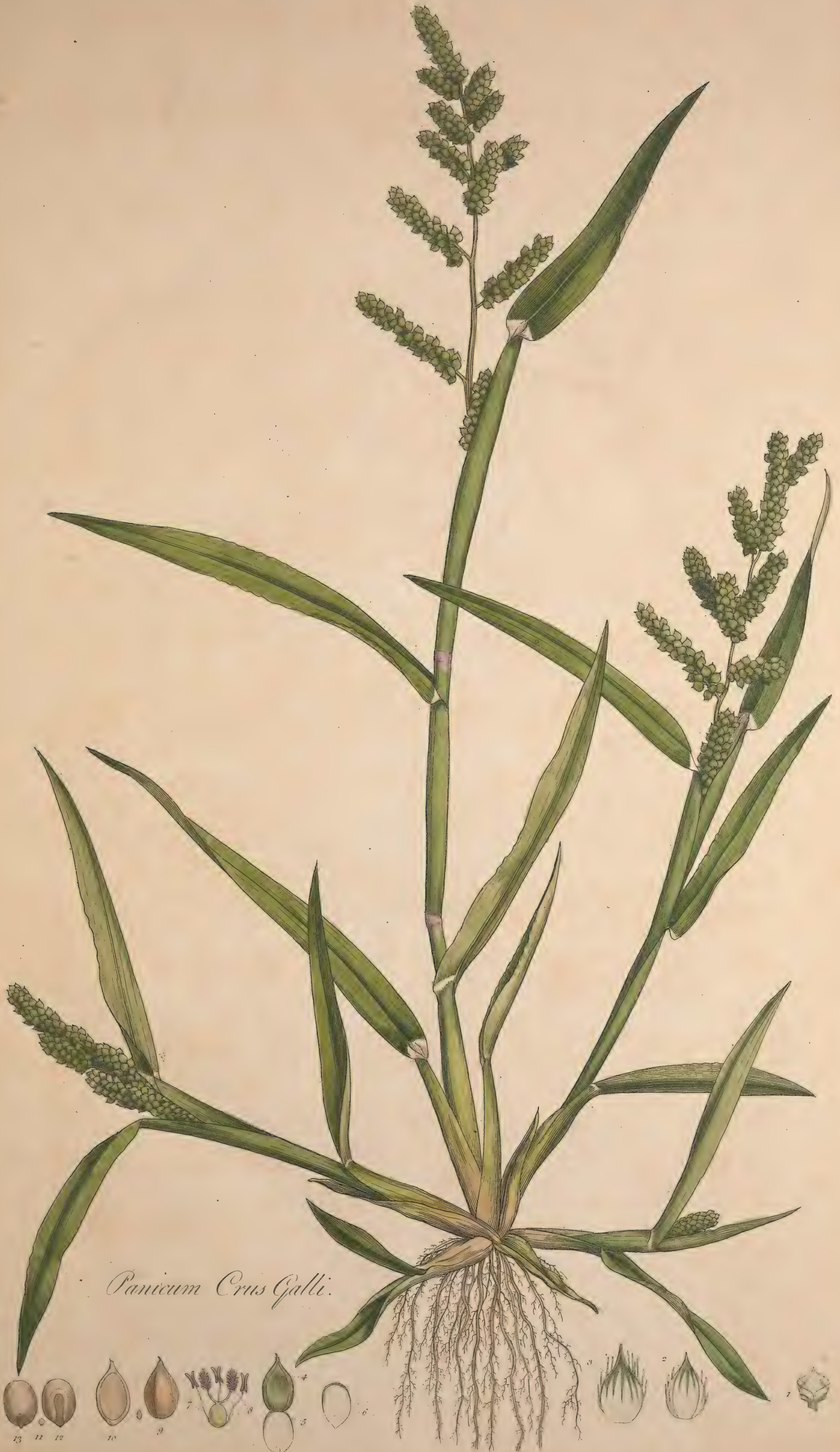
Panicum Crus Galli.