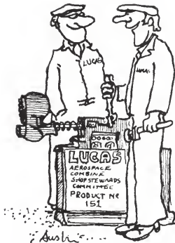
"It's a socially useful device for use on the management"

tarist movement will get round to sabotage, despite the risks. Here in the UK you risk arrest for criminal damage, at the other end of the journey is someone being killed or tortured.