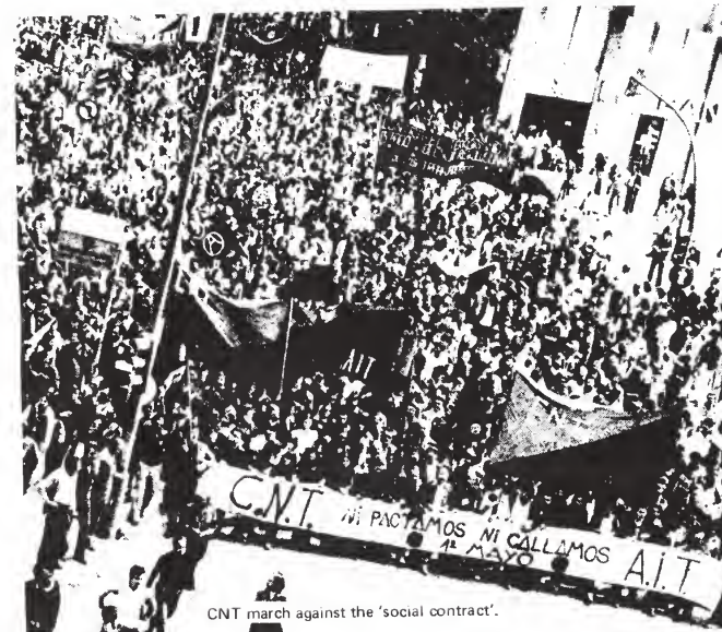
CNT march against the 'social contract'.